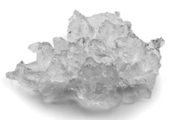
MF 26 Flake ice Residual water content 25%